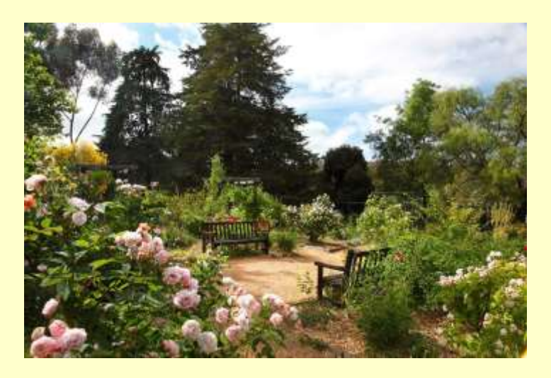
More information is available from our Website https://www.mckaygardens.com.au or on our Facebook page https://www.facebook.com/FriendsofMcKayGardens

If you REALLY like us - become a member of the Committee of Management to help keep the Friends Group alive and well and to ensure the protection of the Gardens into the future!