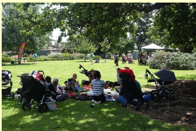
Picnic during the 2018 McKay Gardens Festival being held under an oak planted in 1909

As President of the Friends of H V McKay Gardens for 2021, I recently looked back on my involvement with the Gardens over the last 12 years. When I first noticed them, as I drove to my teaching job each day along Anderson Road during the drought years of 2007 to 2009, what called out to me were the glorious Algerian oak trees, suffering so badly from lack of proper watering. A number of these beautiful trees did not survive those years.