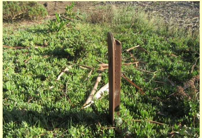
One of two remaining posts from the original Gardens' fencing.

reflecting a characteristic of the Gardens noted in the Victorian Heritage Registration description.