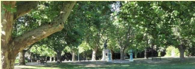
Victoria Gardens Prahran

To register for the Talk, just email the Secretary ( contact@mckaygardens.com.au ) who will send you a Zoom link for the event.